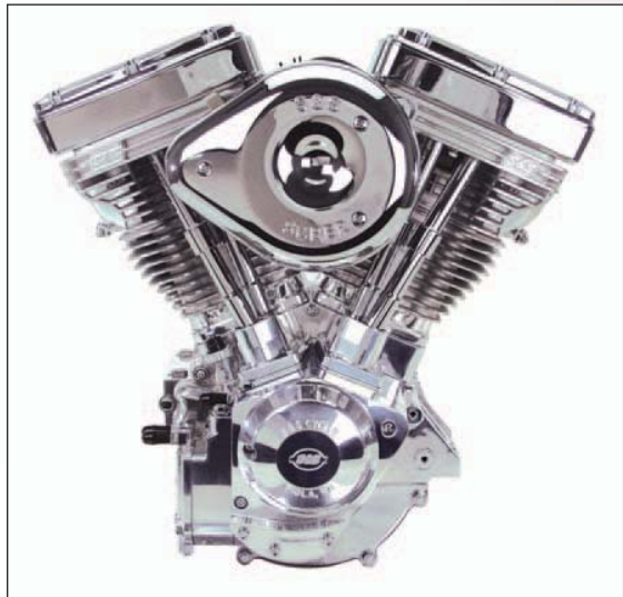
Polished SSW+ Engine with S&S IST Ignition system. IST equipped engines carry an extra year of warranty. Note the special billet gearcover.